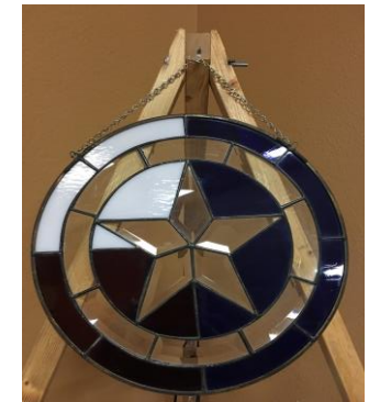
“Star of Texas”

Make your bid on this stained glass “Star of Texas” to hang in the window of your home.